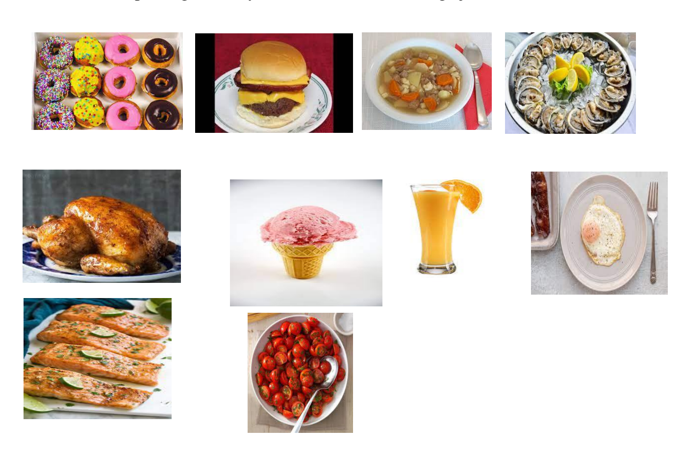
Listening. Watch the video. CAFE

Strawberry ice-cream, salmon, tomato salad, fried eggs, ham and cheese sandwich, soup, doughnuts, oysters, roast chicken, orange juice